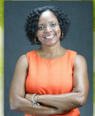
Mayor Katrina Thompson

factors that are taken into account when compiling the budget. Some of the issues the Village faces include long term stability of the sales tax base, increasing pension obligations, rising health care costs, and the funding for vehicle, equipment, and building capital improvements. The Village Board and I remain committed to conservative spending while continuing to invest in our community and providing superior services to our residents. We will continue to evaluate our operations to make certain we are providing services to residents and our business stakeholders as efficiently and economically as possible.