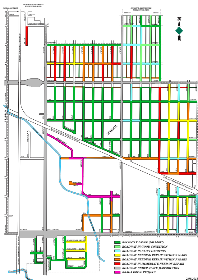
VILLAGE OF BROADVIEW 2018 ROADWAY CONDITION MAP

This years' worst streets chosen for resurfacing are indicted in red on the map below. However, this map is subject to change.